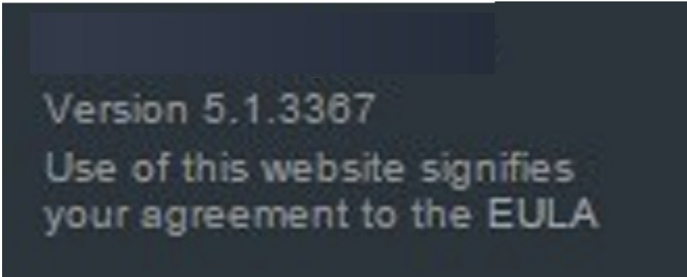
FIGURE 3 Current Cloudpath Version Lower Left